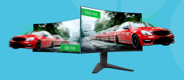
165 Hz Refresh rate

The G27c has a curvature of 1500R that fills your peripheral, offering complete immersion in the game you are playing—so you can enjoy every slight movement. Coupled with a VA panel, this monitor offers wide viewing angle, high screen brightness, and an excellent contrast ratio that further improves game visuals.