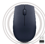
Lenovo 520 Wireless Mouse