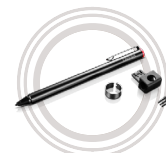
Lenovo Active Pen