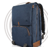
Lenovo 15.6" Laptop Urban Backpack B810