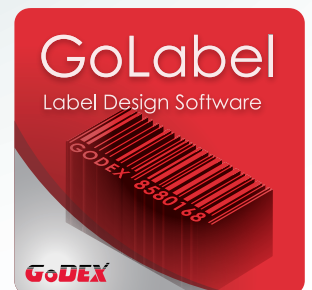
Free labeling software GoLabel for easy printing