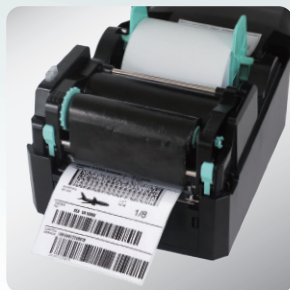
Uses standard low-cost labels and ribbons