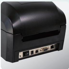
Ethernet, Serial and USB ports included

Use the GE300 for all you light to medium duty thermal transfer barcode printing applications