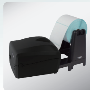
High cost-effectiveness for large amount printing